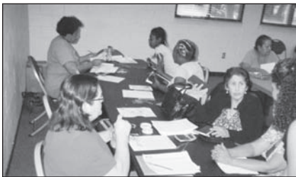
Naples (Collier County) Energy Fair