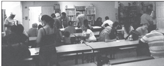
Indian Town (Martin County) Energy Fair