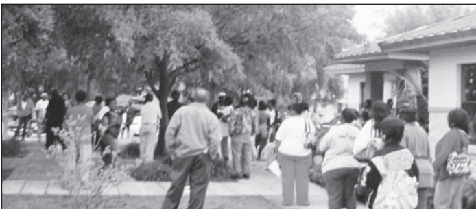
Lake Wales (Polk County) Energy Fair